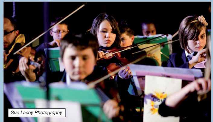
Hertfordshire pupils participating in the 'Count Us In' music project