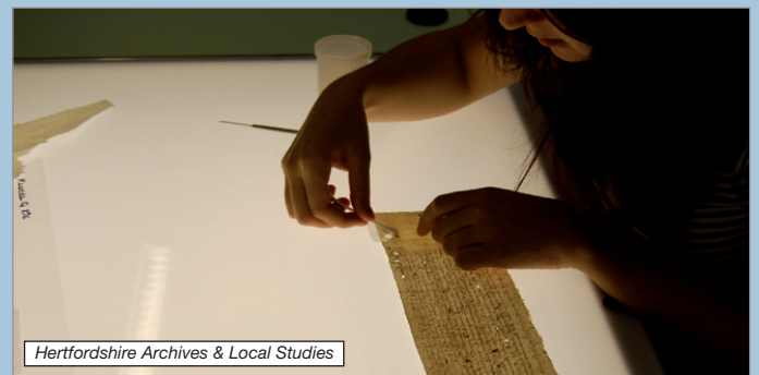
Hertfordshire Archives & Local Studies