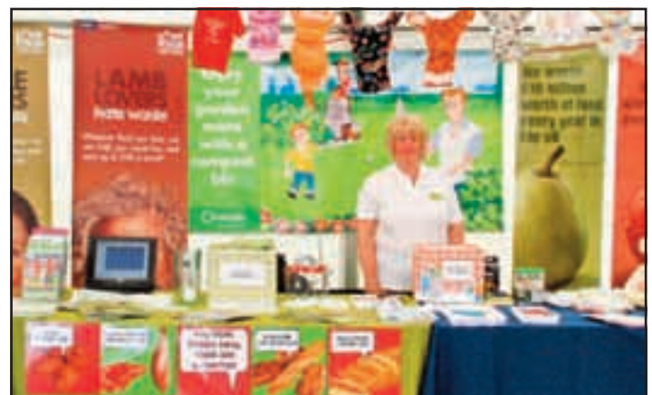
Love Food Hate Waste Campaign at the County Show

1 Includes waste from household collection rounds, waste from services such as street sweeping, bulky waste collection, hazardous household waste collection, litter collections, household clinical waste collection and separate garden waste collection, waste from civic amenity sites and wastes separately collected for recycling or composting through bring/drop off schemes, kerbside schemes and at civic amenity sites.