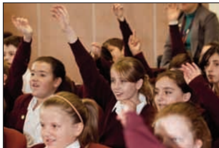
St Joan of Arc pupils take part in Local Democracy week

Events of this kind have been held at Three Rivers District Council for five years running and have proved to be a great success with pupils and teachers.