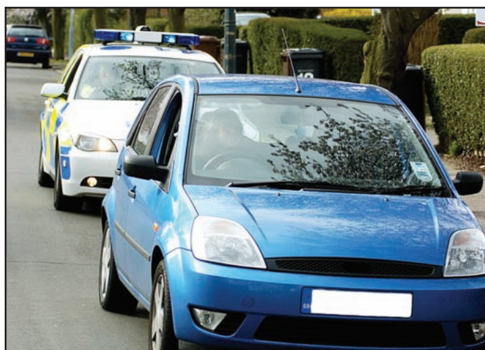
ANPR technology provides proactive tools to deter criminals