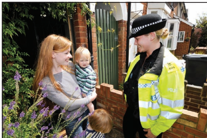
Hertfordshire police was given national recognition for its practices in citizen focus and quality of service in 2008

In 2008 Hertfordshire exceeded all its emergency 999 call handling and attendance targets, providing a rapid response service to those most in need. A new Control Centre opened during 2007 and this purpose-built facility, with state-of-the-art equipment, contributed towards improved and high performance in this area. The Constabulary also met its targets for answering calls to the switchboard. Over 90% of callers were satisfied by the ease of contact and over 95% were satisfied with their treatment by staff.